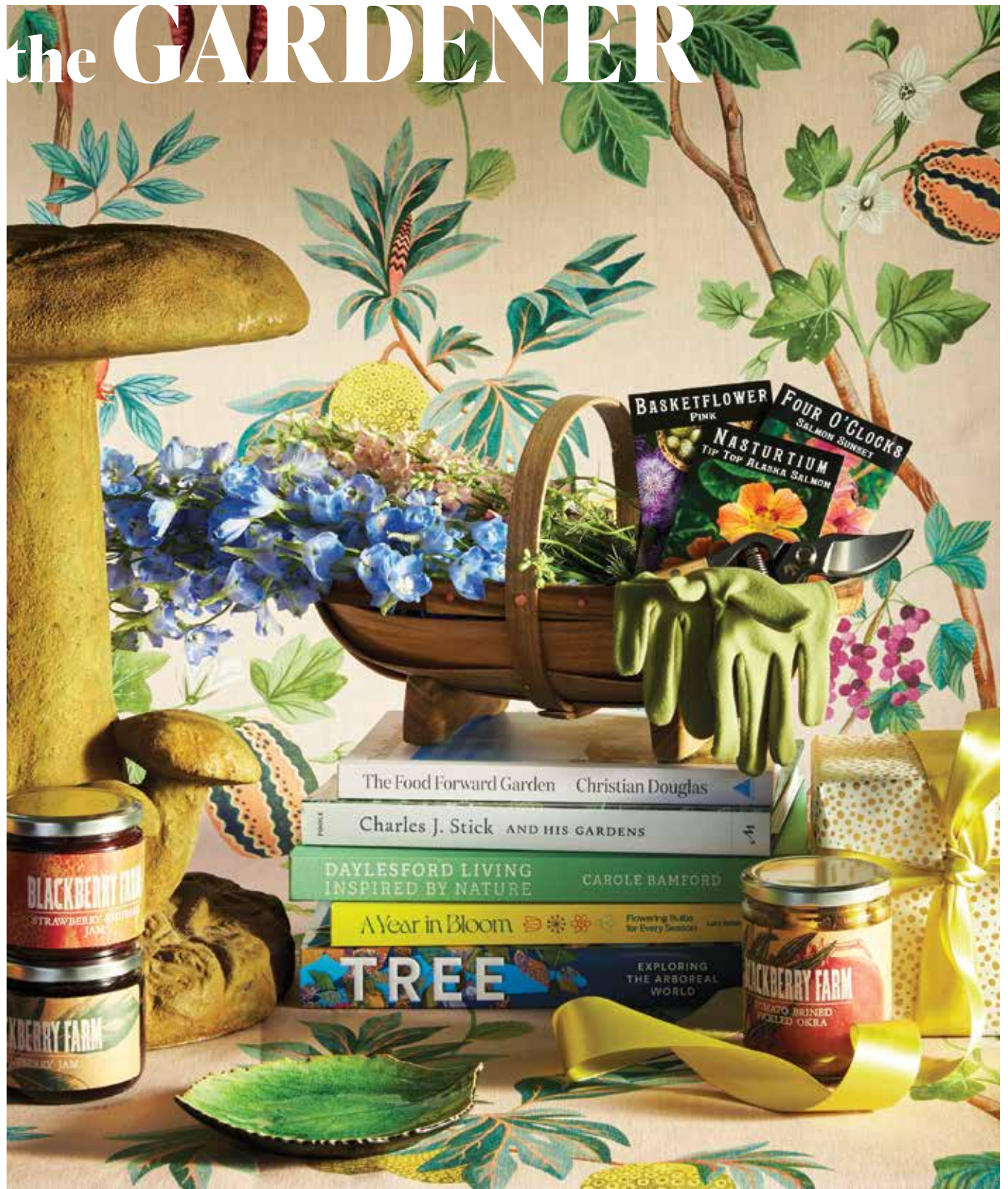
Cast Concrete Mushroom Garden Stool ($195) by Unique Stone through Shoppe • Strawberry Rhubarb Jam ($15), Blueberry Jam ($15) and Tomato Brined Pickled Okra ($16) from Blackberry Farm Shop • Handmade Bentwood with Copper Trug ($98) from Gardenheir • Basketflower, Nasturtium, and Four O'Clock Seeds ($3.50 each) from Rare Seeds • Secateurs Wood Handle ($44) from Earth & Nest • Long Gardening Gloves ($28) by Foxgloves from Shoppe • Gold Foil Flurry Stone Wrapping Paper ($10.50/roll) and Ribbon (prices vary) from Paper Source • Hydrangea Leaf Plate by Costa Nova ($39) from Bradley's Market • Orchard Linen (to the trade) from Osborne & Little