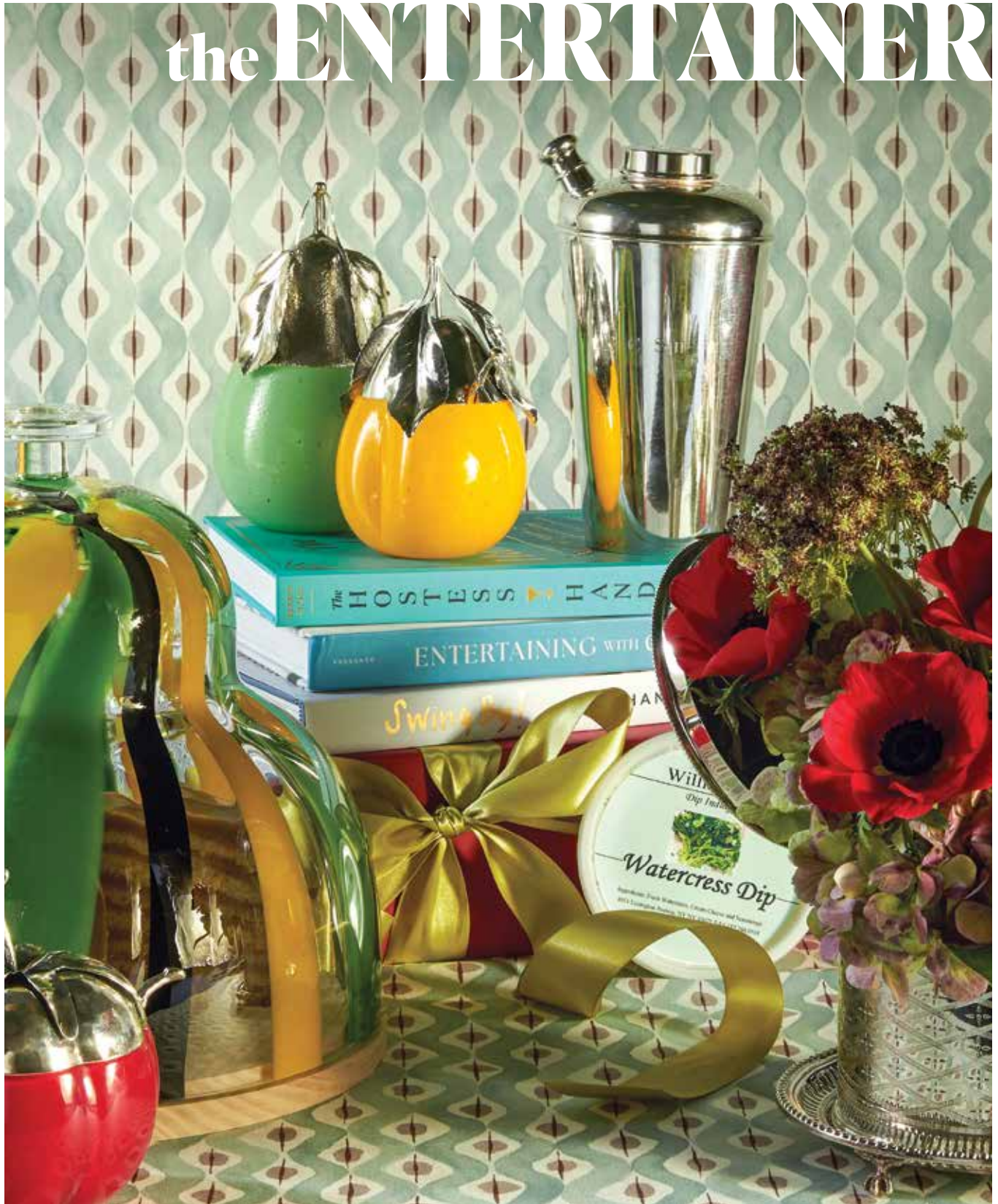
Folk Glass & Wood Food Dome ($275) from West Elm • 7-Layer Caramel Cake ($70) from Caroline's Cakes • Tomato Jam Jar ($3,350), Green Pear Jam Jar ($3,200), and Yellow Plum Jam Jar ($3,100) by Buccellati • Watercress Dip ($12) from William Poll Gourmet Foods • Sterling Silver Cocktail Shaker ($1,950) and 1860 English Silver Plated Biscuit Box with Crest ($910) from Croghan's Jewel Box • Solid Red Wrapping Paper and Ribbon ($10.50/roll) from Paper Source • Beau Rivage fabric (to the trade) from Osborne & Little