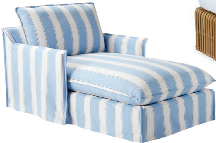
Sundial Wide Chaise in Hydrangea Port Stripe ($5798) from Serena & Lily