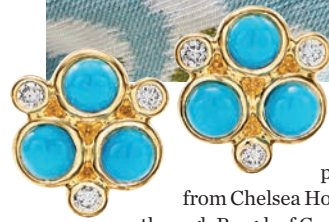
PREVIOUS PAGE: Cupola Pool House Lanterns available in three sizes (pricing upon request) from Bevolo Gas & Electric Lights • Pallas Athena Fabric in Pisces from Fabricut • Wet-Cast Concrete Pavers in Oyster (inquire for pricing and sizes) by FireRock Products THIS PAGE, CLOCKWISE FROM TOP LEFT: Round Dolphin Planter ($430) from Chelsea House • Forest Green Wine Glass ($185/set of 6) by Estelle Colored Glass • Bora Drinking Glass ($185) by Carlo Moretti through Bergdorf Goodman • Sunkiss Daisy Painted Stoneware Salad Plate ($18) and Appetizer Plate ($14) from Hudson Grace • Colette Color Edge Verte Dinner Plate ($100) from Mottahedeh • Mini Pappy Tray ($400) from Pappy & Co. x Thompson Traders • Martellato Five-Piece Place Setting ($114) by Vietri through Hudson Poole Fine Jewelers • Tablecloth (36791-153) and Napkins (35374-13) Fabrics by Kravet (to the trade) FAR LEFT: Classic Trio Earrings ($2500) by Temple St. Clair through Croghan's Jewel Box