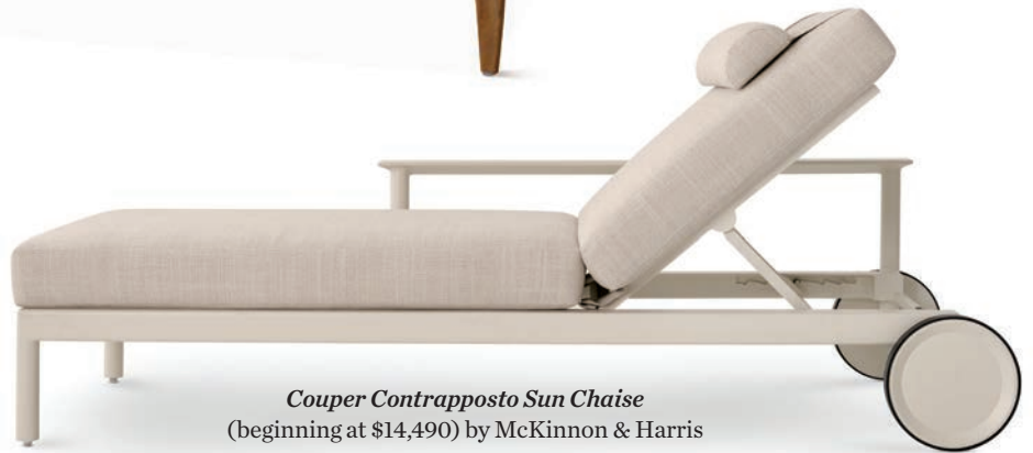
Couper Contrapposto Sun Chaise (beginning at $14,490) by McKinnon & Harris