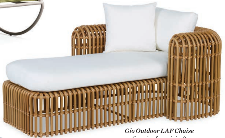
Gio Outdoor LAF Chaise (inquire for pricing) by Carrier and Company for Century Furniture